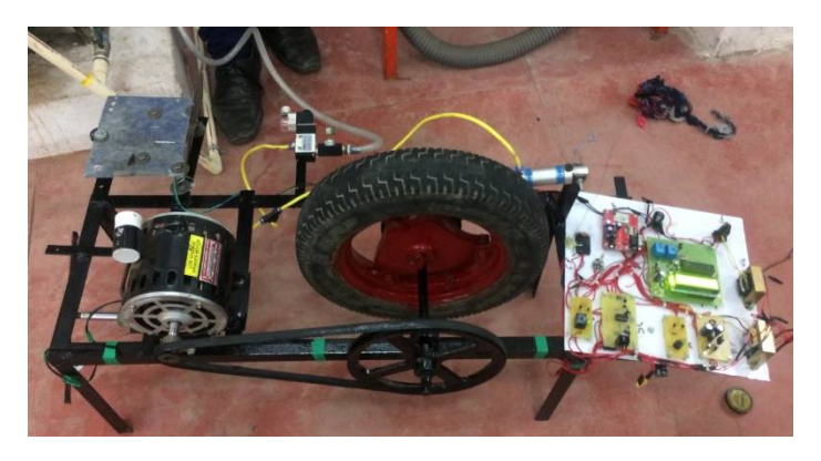
Fig2Image of the setup

If the solenoid valve is activated by the control unit compressed air from the compressor at a pressure of 5 bar passes to the Single Acting Pneumatic Cylinder and the piston in the cylinder will move by this compressed air. If the piston moves forward, then the braking system will be activated. The braking system is used to brake the wheel suddenly or gradually due to the movement of the piston and the braking speed is varied by adjusting the flow control valve. The solenoid valve is also connected to another single acting piston arrangement, which is used to absorb the shock in the bumper there by reducing the impact in the case of an accident. Fig.2 shows the image of the experimental setup of the system.